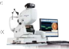
3D Retinal Imaging Device 3D OCT series