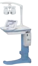
Comp Vision CV-5000/ 1Dial Controller KB-50