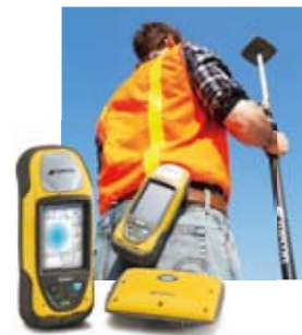
Hand-Held GPS Receiver GRS-1

Integrated GPS Receiver: GRS-1, GR-3, HiPer Pro, HiPer PLUS, HiPer Ga/Gb, HiPer L1 GPS Receiver: NET-G3, Legacy E+, GB-1000, GB-500, Odyssey-RS DGPS Receiver: GMS-110, GMS-2