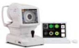
Wavefront Analyzer KR-1W