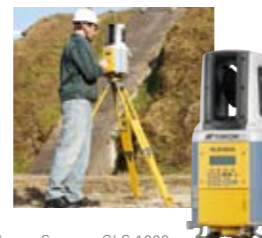
3D Laser Scanner GLS-1000