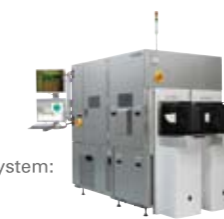
Chip Defect Inspection System Vi-4303FX