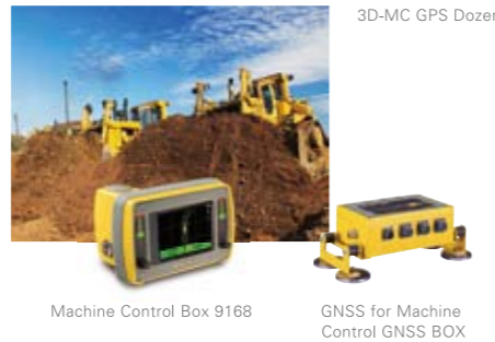
Machine Control Box 9168

Millimeter GPS: Positioning Zone Laser Transmitter PZL-1, Positioning Zone Sensor for Mobile Rover Applications PZS-1, Positioning Zone Sensor for Machine Control Applications PZS-MC Machine Mounted Laser Receiver: LS-B110/110W, LS-B100, LS-B10/10W Total Station for Machine Control: GPT-9000A MC Edition 3-Dimensional Machine Control System: Dozer System Five, Motorgrader System Five, Paver System Five, LPS-900, 3DXi, AT-1 Precision Agriculture Control System: X20, System-110, System-150